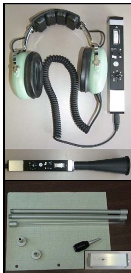
Above: ULD and components

JSC Structures Engineering Division went right to work procuring and certifying the hardware, preparing the formal requests for space-flight and addressing the safety certification. The Mission Operations In-flight Maintenance