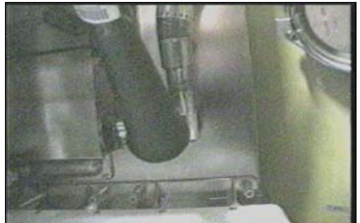
Above: Using the ULD to detect leaks on the International Space Station

For more information, contact CTRL Systems, Inc. at 1.410.876.5676 or e-mail info@ctrlsys.com .